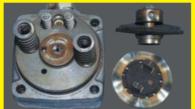
Deposits and gumming on drive train parts so that also rubber gaskets (not illustrated) can fail.