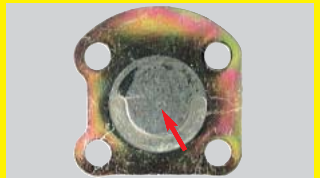
Attacks on the face of the cover plate due to aggressive components in FAME.