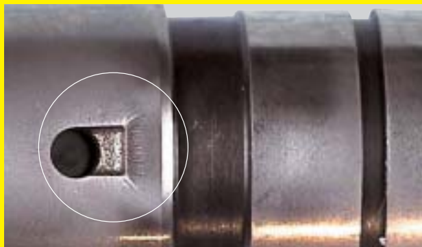
Mechanical wear due to solid particles.