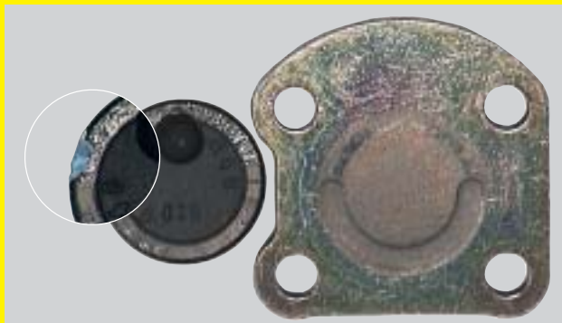
Damage to injection advance piston: Operation with biodiesel (FAME) will clog the fuel filter. This causes the distribution injection pump to suck in air, leading to the erosion of the control valve piston area, such as depicted in the illustration.