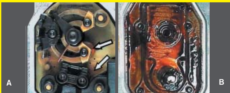
A: Illustration of damage caused by unsuitable fuels such as PME, RME and FAME. Consequences: Hysteresis and consequential high wear, changes to mapped data and an associated wide range of potential faults. (Arrowed = deposits in the half-differential short-circuiting ring sensor mechanism).