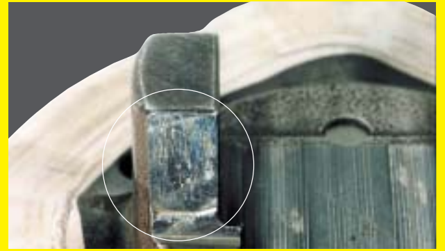
Example Cam plate claw: Clearly visible wear, also on the drive shaft claw and the cross slot in the plate.