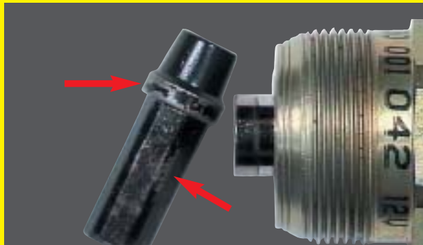
Erosion of solenoid-actuated shut-off parts due to aggressive components in FAME.